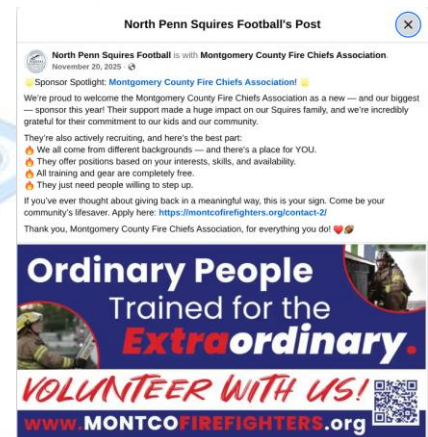
Example Social Media Post