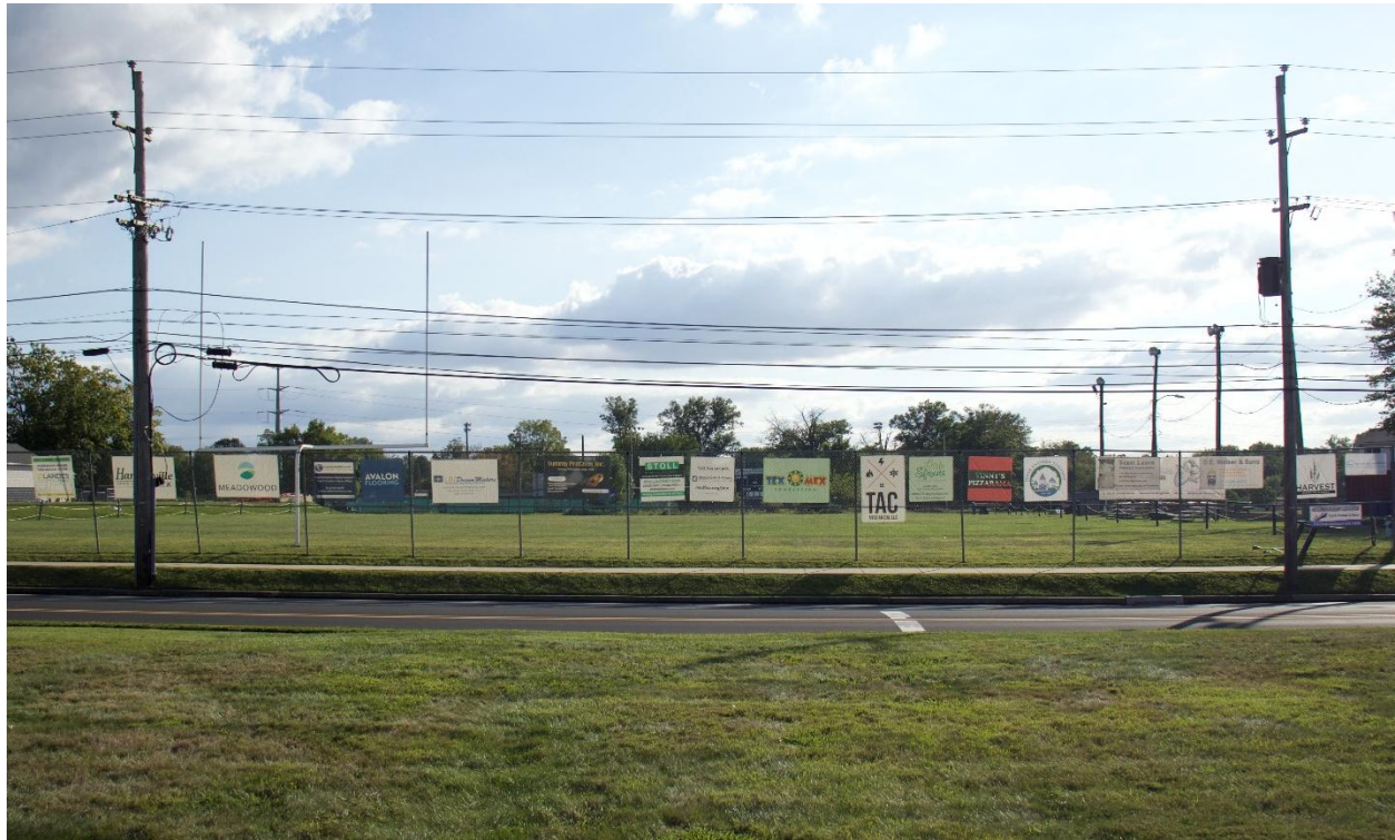
Field Signage location on Hancock Road